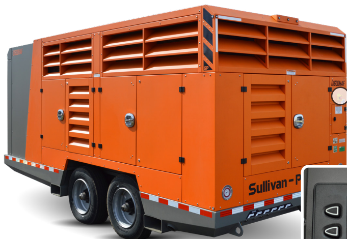
Sullivan-Palatek Electronic Controller (SPEC)