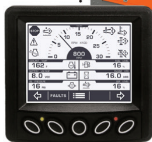
Sullivan-Palatek Electronic Controller (SPEC)

Wider wheel base provides improved balance and stability on the highway and job site