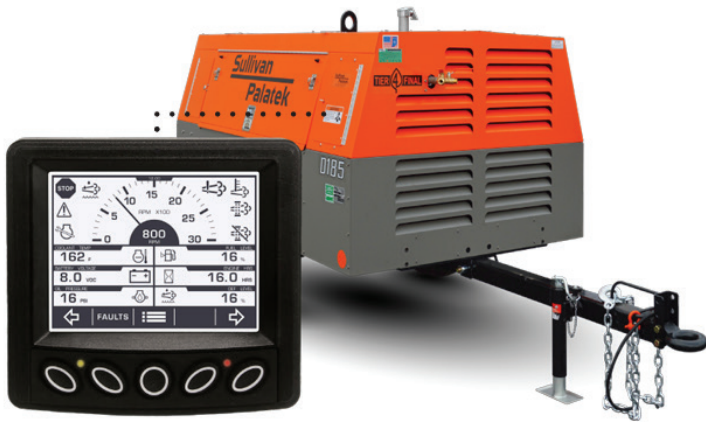
Sullivan-Palatek Electronic Controller (SPEC)